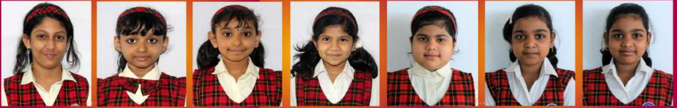
Winners of AKGMA Inter-School Youth Festival held at Dewvale School, Al Quoz, Dubai.