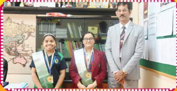
Winners of PROUD TO BE INDIAN Quiz Contest , competing with about 2000 students from different schools of the UAE, organized by Asianet News Channel at De-Montfort University, Dubaiheld.