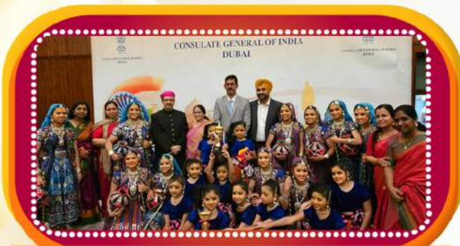
Senior & Junior students have bagged first & second prizes in their respective categories in the International Dance Fest jointly organized by Act Universe and India Consulate, Dubai.

Scholars Indian Private School serves as a fertile ground for nurturing a multifaceted skill set among its students, extending far beyond the confines of the classroom. By immersing participants in diverse inter-school competitions, the institution not only broadens their horizons but also fosters a deep-seated cultural appreciation and understanding. Sending students to engage in these contests is akin to embarking on a voyage for gold; for upon their return, they not only bring back trophies but also the gleam of triumph. Herein lie the tales of several teams from our school who, like adding another string to our bow, have gracefully embellished our collective achievement.