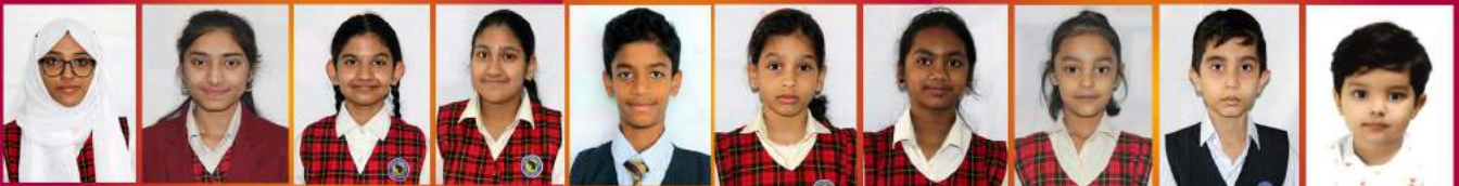
Winners of Chethana Drawing Competition 2023-2024.