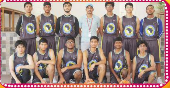
CBSE Basketball Cluster Quarter Finalist under-19 boys category conducted in Delhi Private School, Dubai.