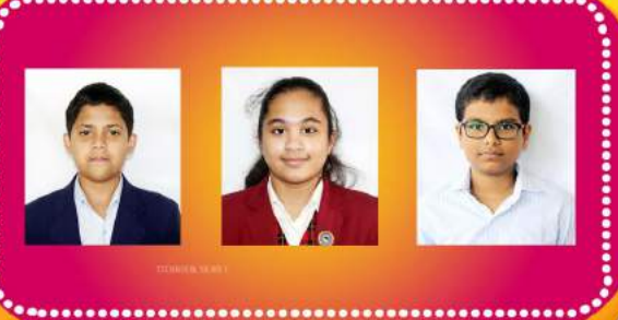
Bhavans Inter-School Quiz Competition (Season-5) First Runner-Up conducted in Pearl Wisdom School, Dubai.