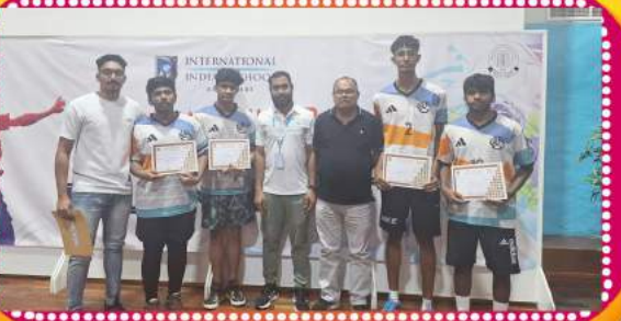
CBSE Badminton Cluster Quarter Finalist under-19 boys category conducted in International Indian School, Abu Dhabi.