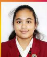
Winners of Poster Making Completion conducted by Science Indian Forum, RAK.