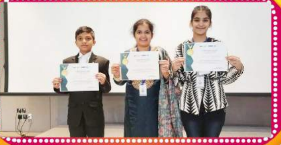
Drawing & Colouring Winners of RAK Innovation & Sustainability Challenge (RISC) 2024 as well as for presenting their winning solution at the IWAM 2024 conference.