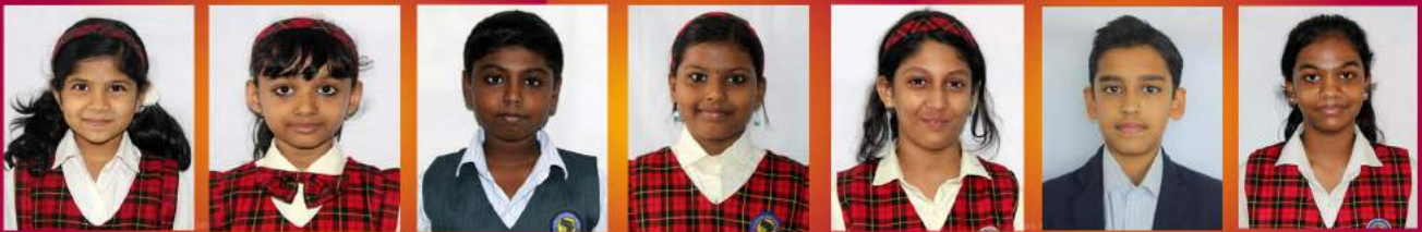
Winners of International Bharath Parv conducted by Act Universal with patronage of Consulate General of India, Dubai.