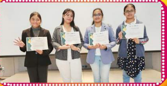
Poster Making Winners of RAK Innovation & Sustainability Challenge (RISC) 2024 as well as for presenting their winning solution at the IWAM 2024 conference.