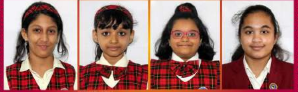
Winners of Swanthanam Inter-School Youth Festival conducted in Gulf Model School, Dubai.