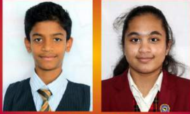
Winners of Inter-School English Poem Recitation Competition (CADENCE 2023) by Emirates Future International Academy, Abu Dhabi.