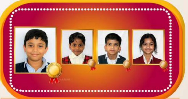
Bagged GOLD & BRONZE MEDALS in the AMERICAN MATHEMATICS OLYMPIAD 2023-2024 .