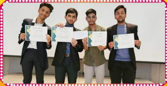
Presentation Winners of RAK Innovation & Sustainability Challenge (RISC) 2024 as well as for presenting their winning solution at the IWAM 2024 conference.