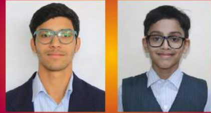
Winners of Squash Tournament held at Etisalat Academy.