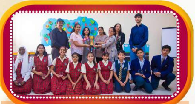
Scholars notched up the CHAMPIONSHIP TROPHY in the Inter-School Impromptu Speech Competition organized by ACT UNIVERSAL at Ambassador School, Sharjah.