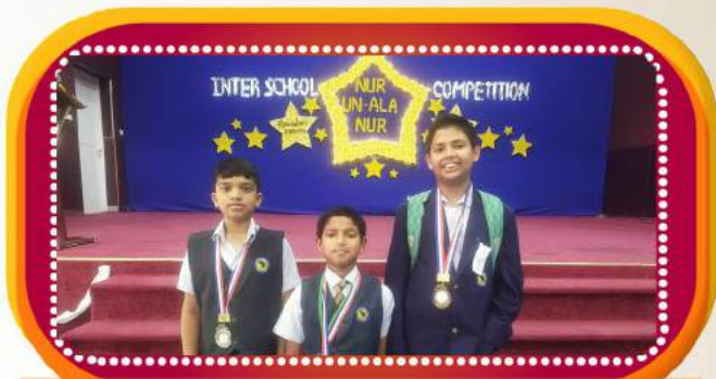
Achieved second & third prizes in ISLAMIC INTER-SCHOOL COMPETITION organized by the Indian Academy, Dubai.