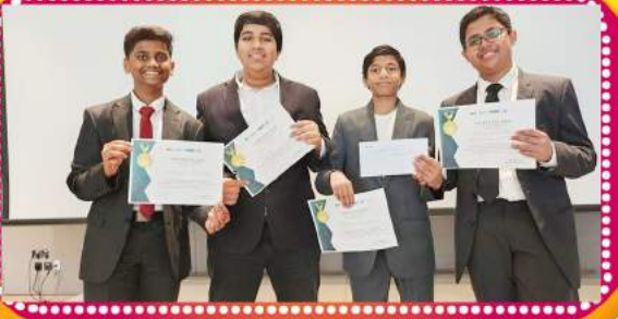
Case Study Winners of RAK Innovation & Sustainability Challenge (RISC) 2024 as well as for presenting their winning solution at the IWAM 2024 conference.