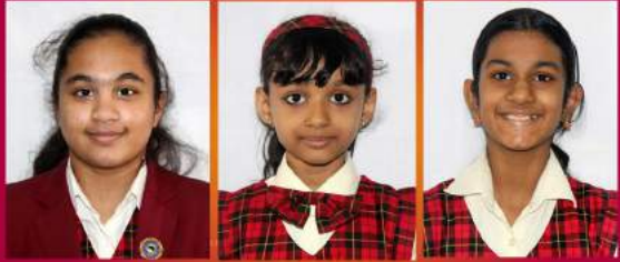
Winners of Talent Fest - Indian Social and Cultural Club, Fujairah.