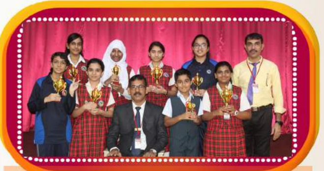
Bagged 8 out of 13 prizes in the Al Naeem Mall hosted the "Naeem Art Challenge," a sketching competition 2023.