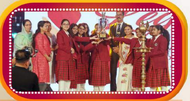
Bagged FIRST PRIZE in the Inter-School Theme Dance Competition held by Legends Arts Centre, Ras Al Khaimah.